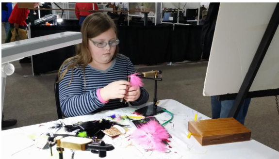
This young lady tied 13 flies or more at the Kids Fly Tying booth, Kentuckiana Fly Fishing Show 2017!