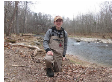
Young guys too!