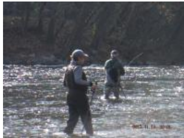
Hard at it!