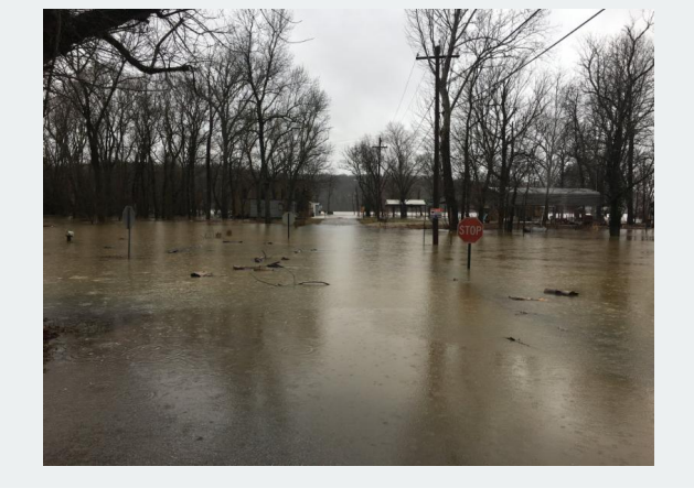
Leavenworth Indiana, February, 2018.