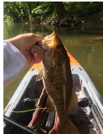
Matt Devine with a Floyds Fork Smallmouth