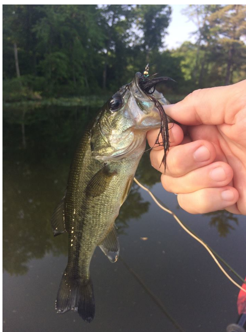
Valerie Meyers with a largemouth caught on a peacock feather woollybugger she tied!