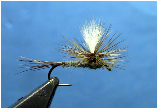
Parachute Adams Dry Fly