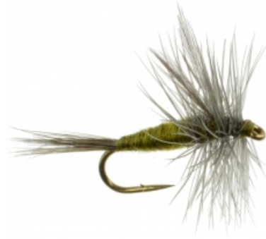
Blue Wing Olive Dry Fly

Admission to our fly tying classes is FREE! Club membership is not required! You need bring only yourself. All tools and materials are furnished free by Derby City Fly Fishers. The teacher will lead the tying instruction, which is shown on a screen. Experienced tiers will circulate among the students to provide assistance if you need it.. You will leave with a couple flies you tied that are capable of attracting and catching fish, and the ability to tie more of them yourself!