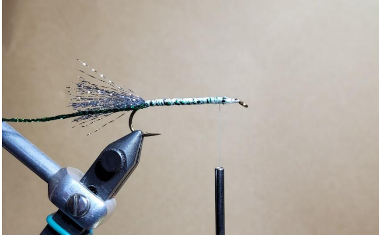
Tie in green tinsel on near side of hook shank.