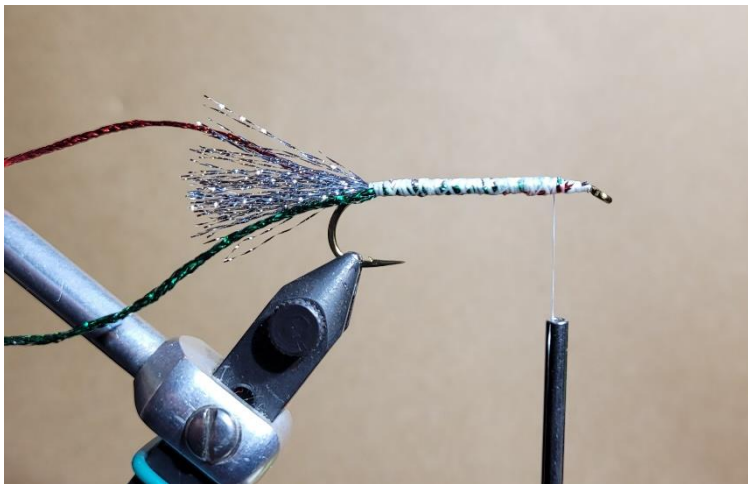
Tie in red tinsel on back side of hook shank.