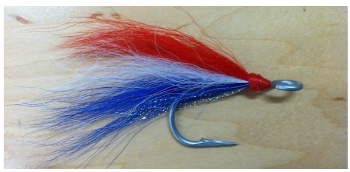
July 2023 Newsletter