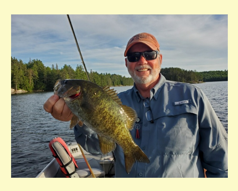
The Ache for Returning

Some of my earliest childhood memories are of fishing trips with my