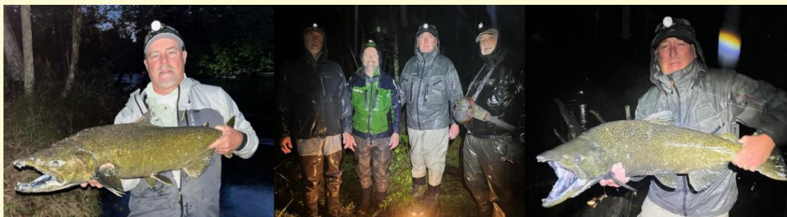
Some photos from the soggy Pere Marquette trip.